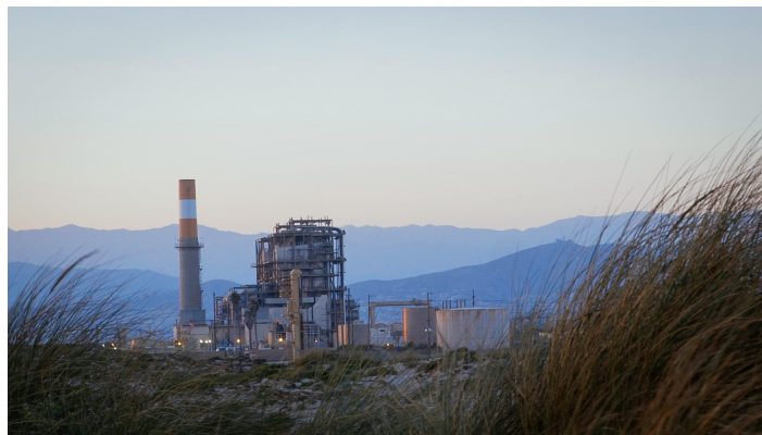
Mandalay Bay gas plant in Oxnard, CA.