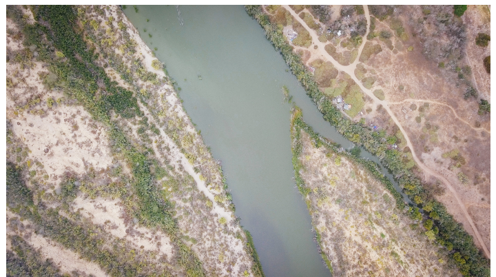
The banks of the Utom , the Santa Clara River.

Utom and its ecosystem is within Chumash traditional territory and Chumash people, now and since time immemorial, live in relationship with the river. The pipelines and transmission lines that will be built to connect Calpine's power plant to the gas systems that extend far beyond California's borders will disturb Chumash sacred sites, cultural and natural cultural resources, and harm