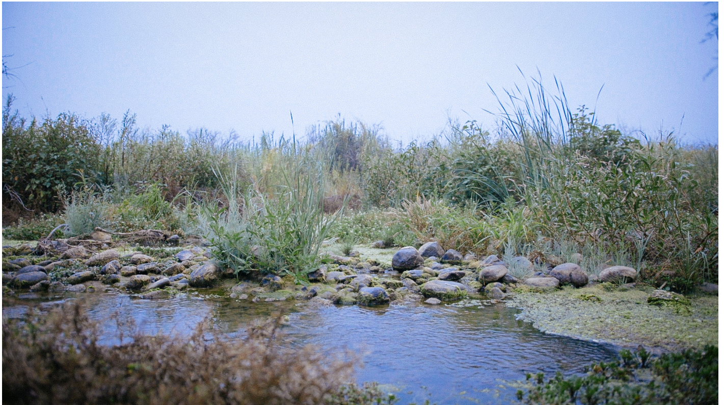
The Utom , the Santa Clara River.